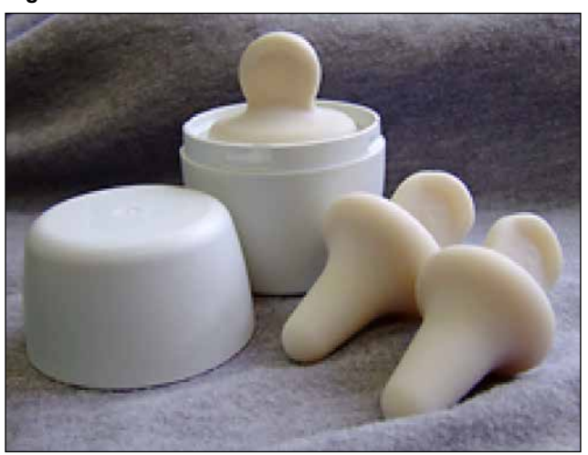
Figures 1 to 9 are reproduced with permission from CooperSurgical Inc., Trumbull CT, and Figure 10 is reproduced with permission from EastMed Inc., Halifax NS

of prolapse<sup>6</sup> and of urinary stress incontinence. They are cost-effective in the treatment of prolapse.<sup>7</sup> Women choosing pessary for the treatment of prolapse are as likely to be satisfied and to have improved pelvic floor function as those selecting surgery.<sup>8</sup>