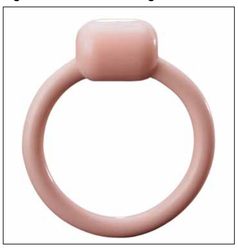
Figure 8. Incontinence ring