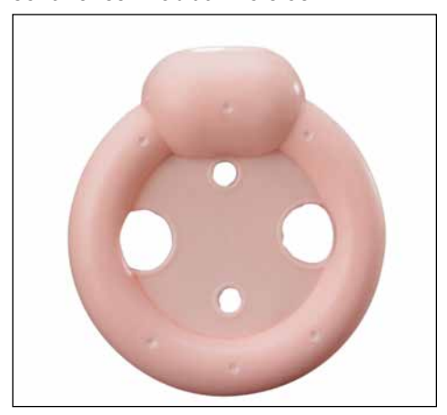
Figure 7. Ring pessary with support and continence knob at 12 o'clock