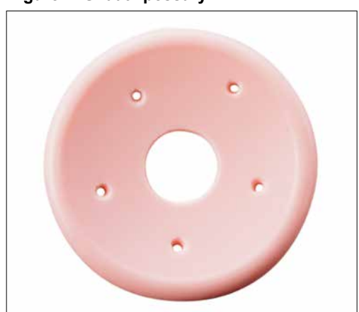
Figure 2. Shaatz pessary