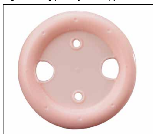
Figure 1. Ring pessary with support