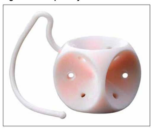
Figure 3. Cube pessary