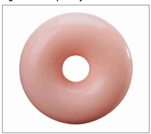
Figure 5. Donut pessary