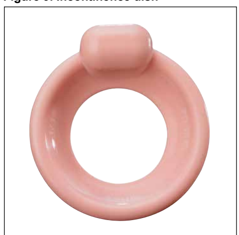
Figure 9. Incontinence dish